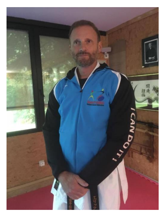
Ukrainian Karate Federation Chairman